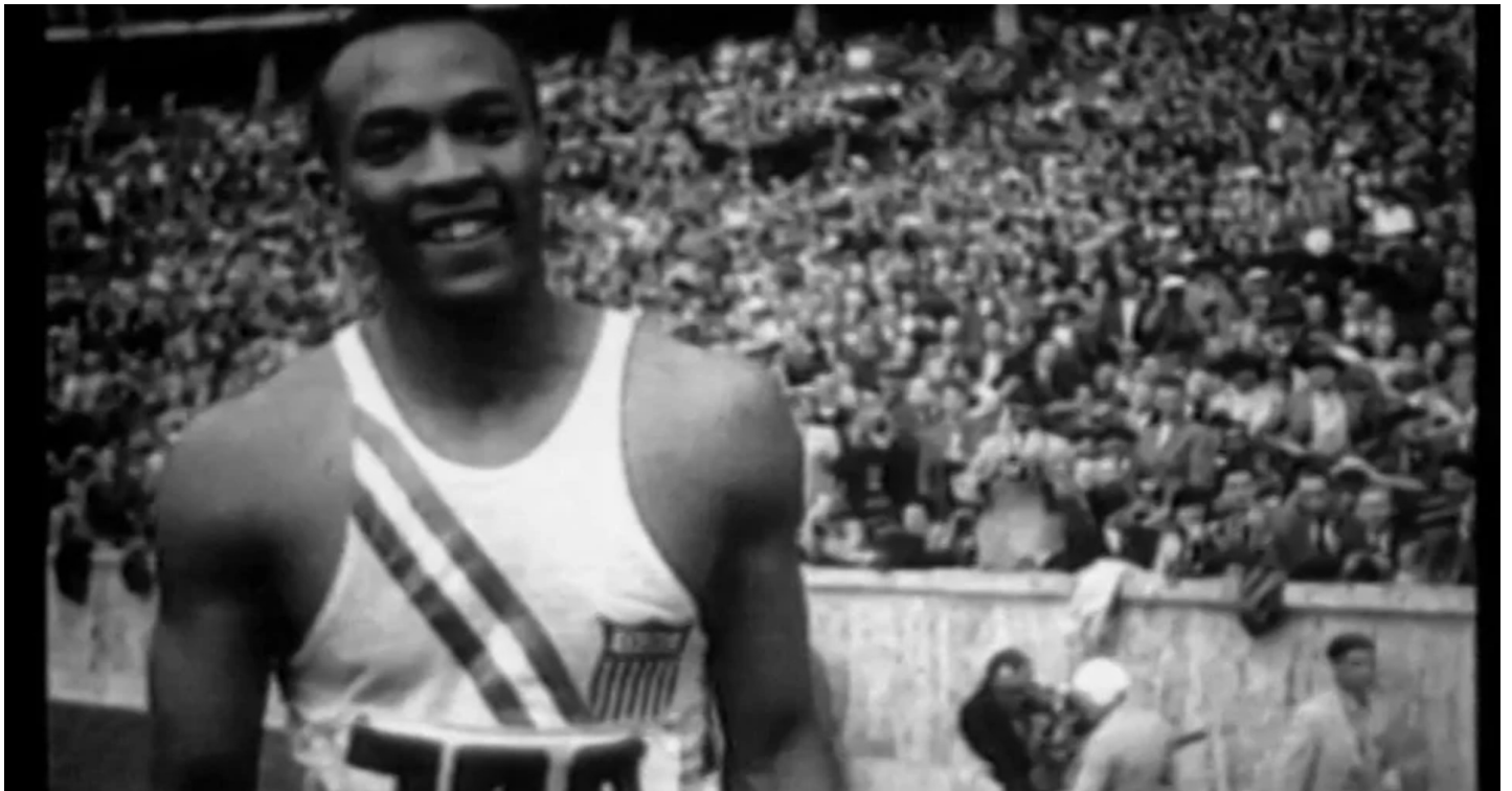
Jesse Owens, 1936

“Find the good. It's all around you. Find it, showcase it and you'll start believing it.”