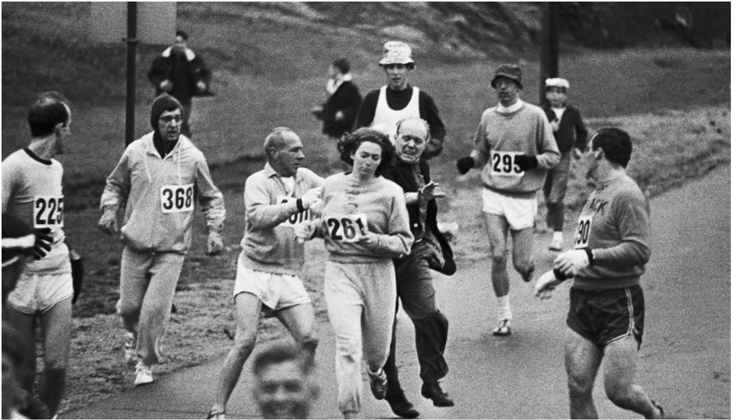
Kathrine Switzer being attacked while running the Boston Marathon, 1967