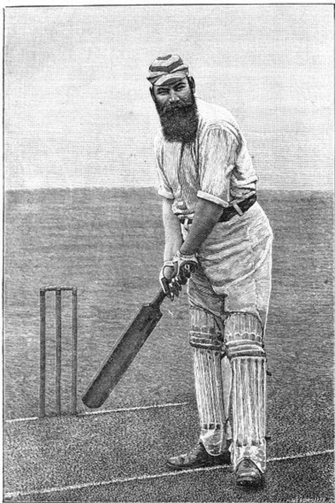
W. G. Grace, 1891

with spectators, and the Indian Premier League, a competition conducted in this format which began in 2008, has been described as ‘the most lucrative and popular form of cricket’ by the online encyclopaedia Britannica. In the IPL, eight teams represent eight Indian cities, and teams may recruit players from overseas. The financial rewards offered to professional players by these teams has created new opportunities for players to accumulate wealth and celebrity status. In addition, there is also a T20 World Cup played every two years. The T20 format has been credited with the revitalisation of cricket for the twenty-first century, and also for renewing interest in cricket from young players.