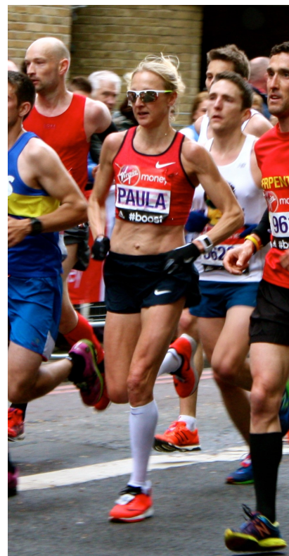
Paula Radcliffe at the 2015 London Marathon. She holds the world record for the fastest female marathon with a time of 2:15:25 set in 2003.