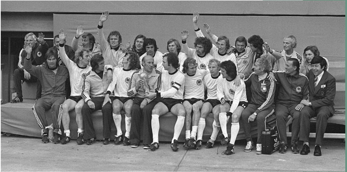
West German World Cup Team, 1974

times, eventually losing to Bayer 7 – 5. Later that night footage emerged of Lippman celebrating the opposition’s second goal. That night he fled, escaped the Stasi and settled in the West.