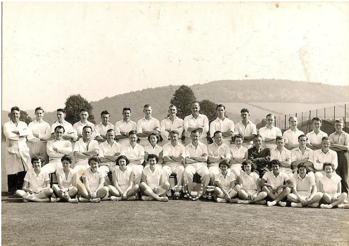
Monmouth Cricket Club, mid-1950s