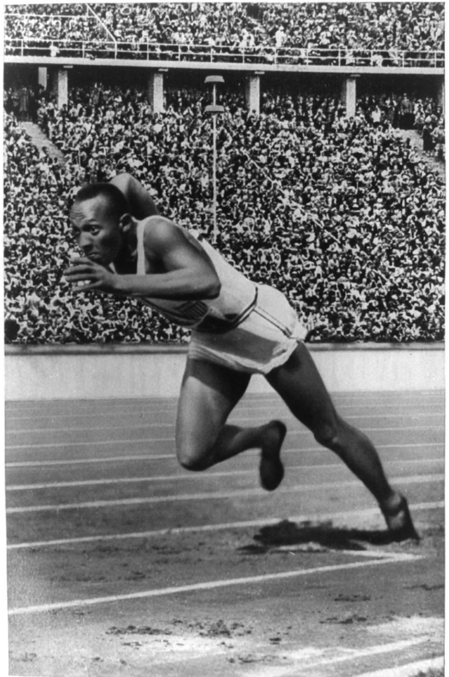
Jesse Owens at the 1936 Berlin Olympics

The following quote from his official website sums his lasting influence on the sporting world: "Jesse Owens proved in Berlin and thereafter that he was a dreamer who could make the dreams of others come true, a speaker who could make the world listen and a man who held out hope to millions of young people."