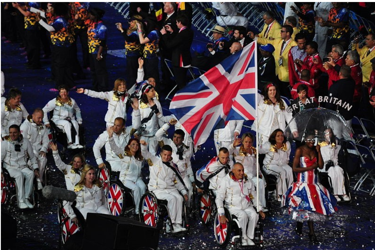
Team GB at 2012 Paralympic Opening Ceremony