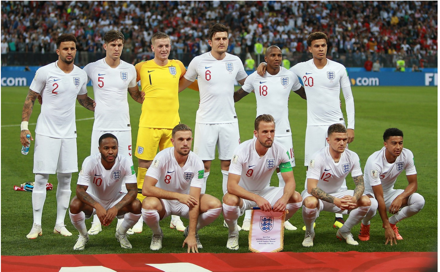
England National Team: World Cup 2018